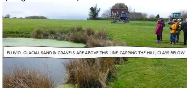
Photo above shows the gravel-clay interface and the diagram below illustrates how a perched water table can occur.

The walk continued to Botolph Claydon where the group examined the link between the hydrology and geology by visiting the Bernwood springs, ponds and Botyl Well. Glacial outwash gravels and sands cap the hill top, sitting on Jurassic clays. Rainwater drains through the permeable hill top gravels, but on reaching the underlying clay the water moves laterally out to form a spring line below the crest of the hill top ridge, marking the boundary of where the gravel sits on the clay. The springs feed small ponds.