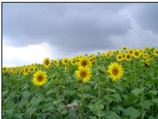
Sunflower crop at Downley Common. What changes will global warming bring?