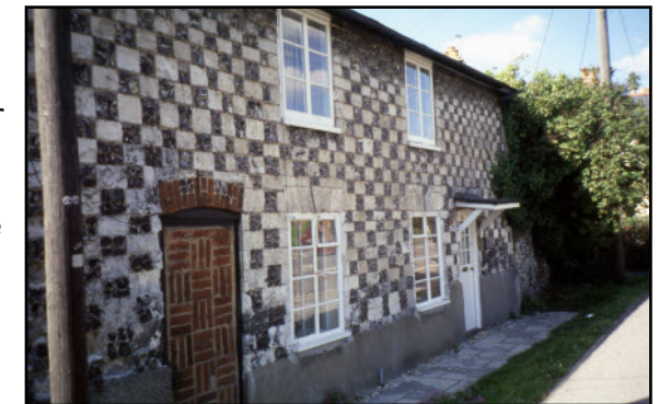
The ‘chequerboard house’ in Princes Risborough.