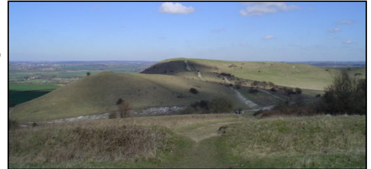
The hillfort at Ivinghoe Beacon built 2,800 years ago and a popular site to visit today.

Wells..... A number of Chalk 'wells' have been dug in the Chilterns, these excavations are for Chalk extraction and not for water. These seemed to be mostly worked during the 18 th and 19 th centuries and written accounts describe how it took three men to cut the Chalk and raise it in baskets tied to a rope that ran over a pulley and windlass. The Chalk was commonly used for spreading over fields to break up clay soils, but it was also extracted for lime-burning. Once dug they are a hazard to the unwary as they could be 30 feet deep, so they were covered, but not always effectively as the covers can fail and the shafts can unexpectedly re-appear!