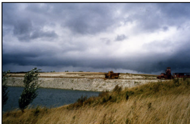
College Lake Nature Reserve - previously a Chalk quarry owned by Castle Cement.

Today's main industries include agriculture, woodland management, sports, education, leisure and tourism. Some of the traditional industries are still on the go, for instance clay extraction at Dunton's Brickpit with specialist brick-making at H.G.Mathews in Chesham.