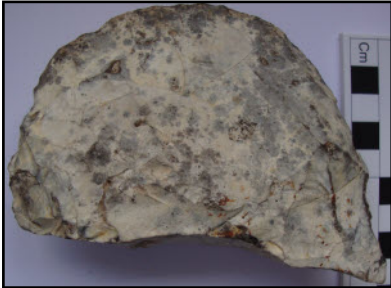
A hand axe from the middle Palaeolithic period from the River Thames terraces.