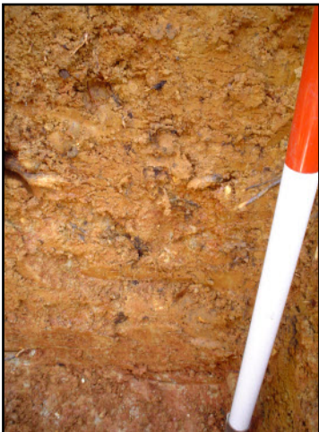
Section showing Reading Formation clays at Downley Common. These clays were present in discontinuous and sinuous outcrops. The result of chasing these thin outcrops is an unnatural landscape full of bumps and hollows.

Brick and tile manufacture ..... Tile making in the Chilterns is known to date back to the 13 th century where Ley Hill is a good example. This was a valuable industry – in the 13 th century the price for roof tiles averaged about 3 shillings per thousand. Penn and Tylers Green made floor tiles from 1340 to 1390. Kilns making tiles usually also made bricks. A kiln present in the mid-1700's at Downley Common appears to have made bricks for the West Wycombe Estate. The feature all these sites have in common is the presence of the Reading Formation clays at the surface. These clays are 40 million years old and produce a good quality product.