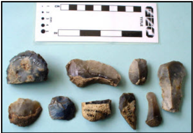
Scrapers (about 7 to 8,000 years old) from a Mesolithic hunting camp at Cadmore End where they made the tools.