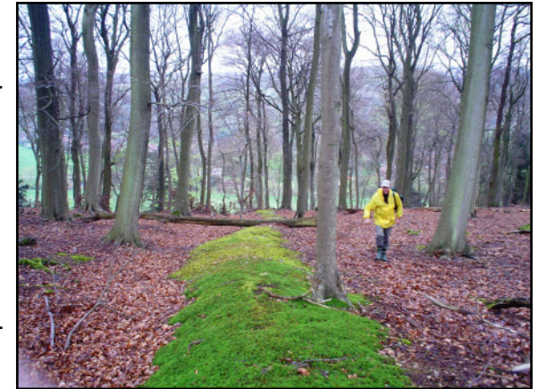
A wide ditch and bank forming a Norman woodland boundary (c.1100AD)

This leaflet was produced by Bedfordshire Geology Group on behalf of Buckinghamshire Earth Heritage Group with the support of The Chilterns Conservation Board