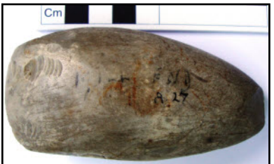
A Neolithic polished axe (between 6 and 4,500 years old) from Hambleden. This example was worked from flint obtained from the gravels of the river Thames. Often these were ceremonial, and hence not used for felling trees.

People have been living in the Chilterns since the Lower Palaeolithic (Old Stone Age) from at least 400,000 years ago. Discarded or lost stone tools are evidence for habitation and occasionally they made the tools on sites in the Chilterns. These camps, with working floors for tool manufacture, are particularly exciting to find. Neolithic people also dug mine shafts to reach layers of quality flint within the Chalk. Depressions in Pitstone Hill near Ivinghoe mark the locations of some of these mines.