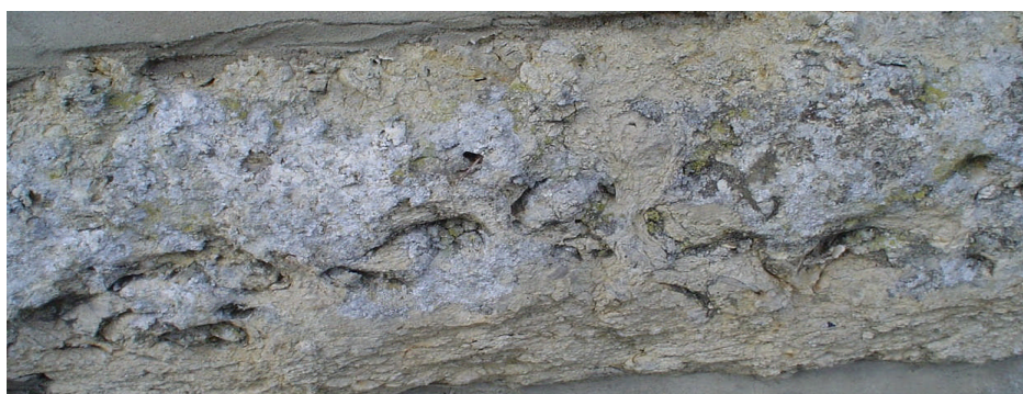
Portland Limestone in the High Street full of lime mud and fossil shells

The Portland beds were laid down in a warm, shallow tropical sea about 150 million years ago. Evidence for this is the limestone itself and also fossils such as ammonites.